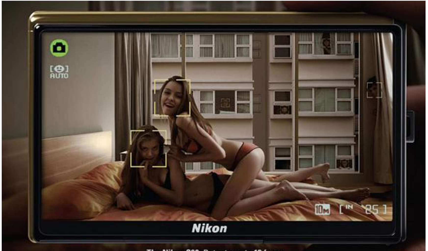
The Nikon S60 Detects up to 19 faces